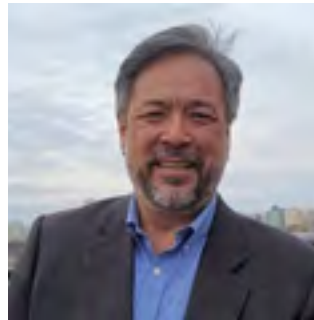
Deputy Minister Daniel Quan- Watson

— Canada's Minister of International Trade, Export Promotion, Small Business and Economic Development