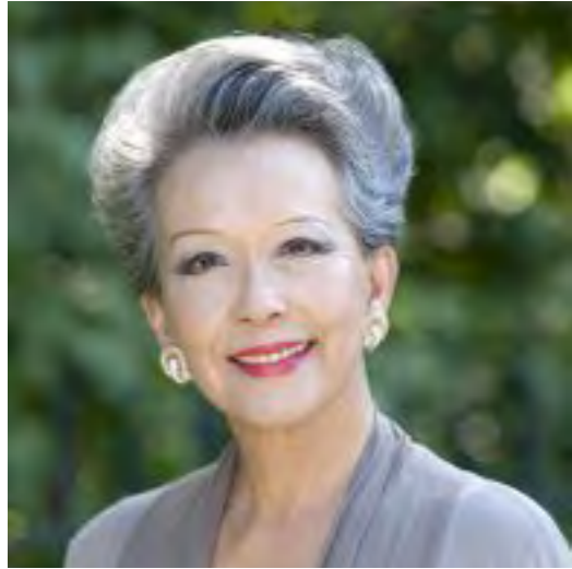
The Honourable Vivienne Poy