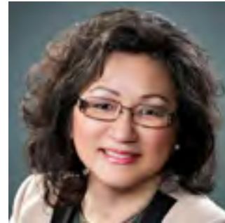
Honourable Teresa Woo- Paw Executive Council of Alberta

The first and only Federal Deputy Minister