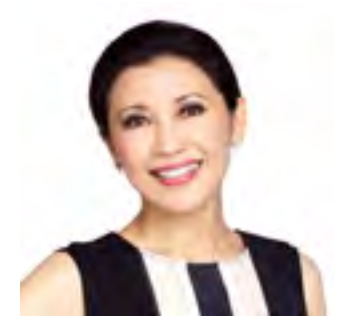
Chan Hon Goh

— Former leader of the Saskatchewan Green Party