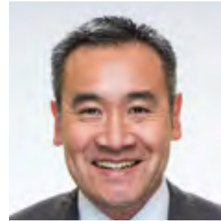
Honourable Michael Lee

— MLA for the Legislative Assembly of British Columbia