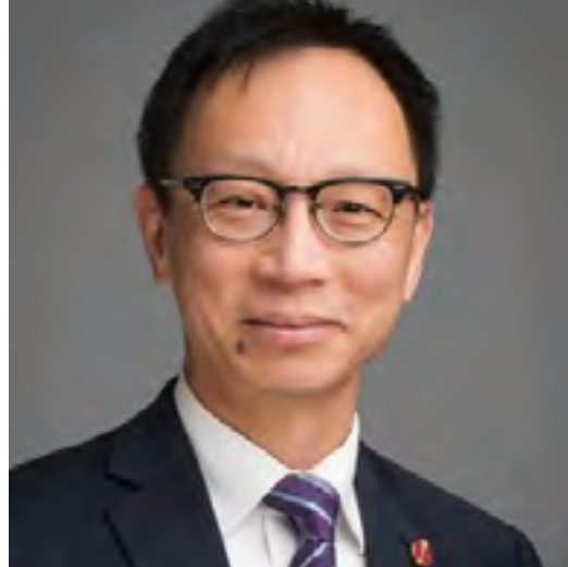
The Honourable Yuen Pau Woo