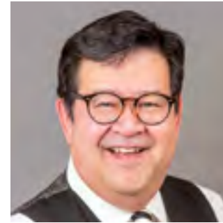
Honourable Gary Mar, Executive Council of Alberta

— MLA for the Legislative Assembly of British Columbia