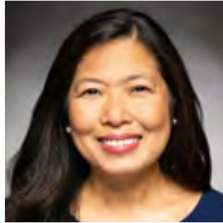
Hon. Mary Ng, P.C., M.P.

— Canada's Minister of International Trade, Export Promotion, Small Business and Economic Development