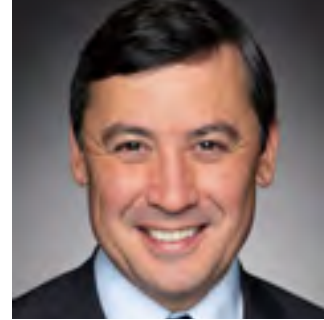
Honourable Michael Chong

— Stand-up Comedian and 2022 Juno Winner for Comedy Album of the Year