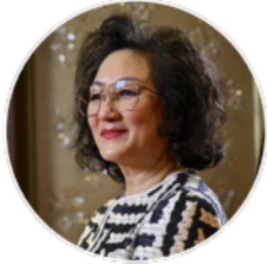
THE HONOURABLE TERESA WOO-PAW ECA