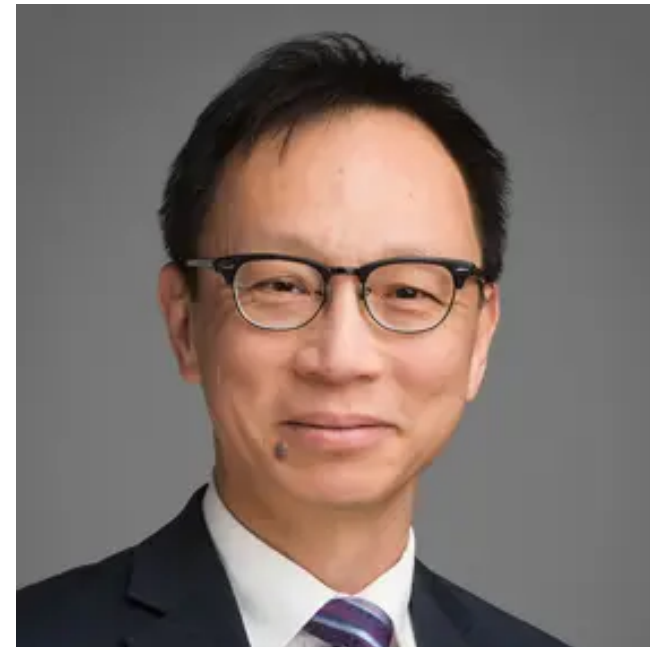
The Honorable Yuen Pau Woo Senator