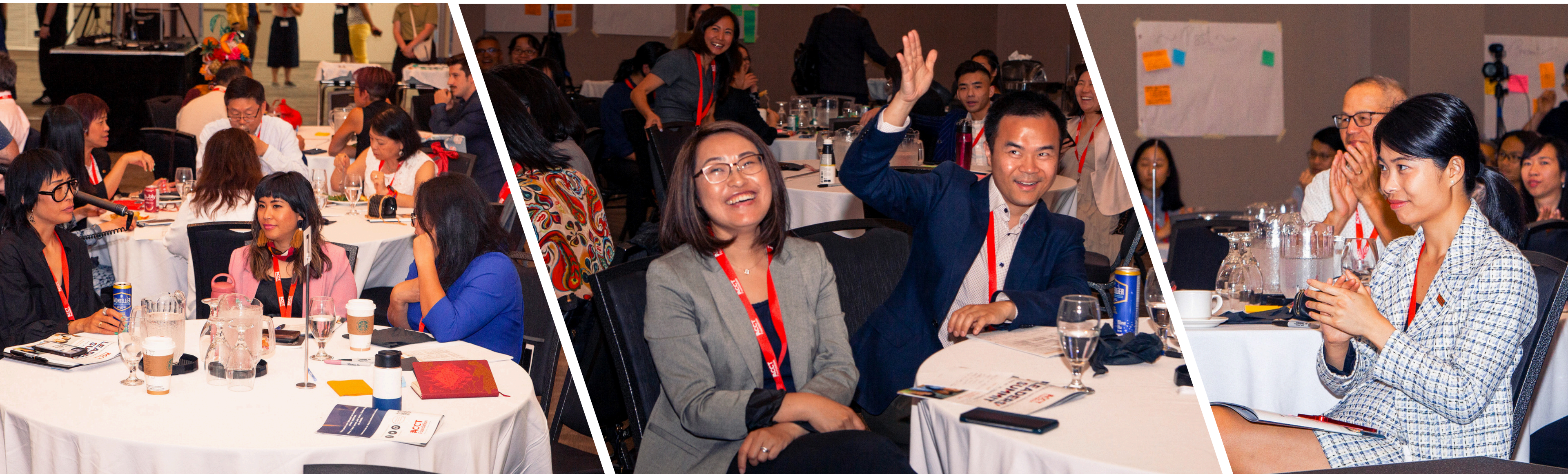
Participants of 2023 Leaders' Summit in Ottawa

We honour and celebrate the ground-breaking achievements of past and present Chinese Canadian leaders in society and equip the next generation of leaders with a keen sense of how their culture shapes and strengthens their leadership.