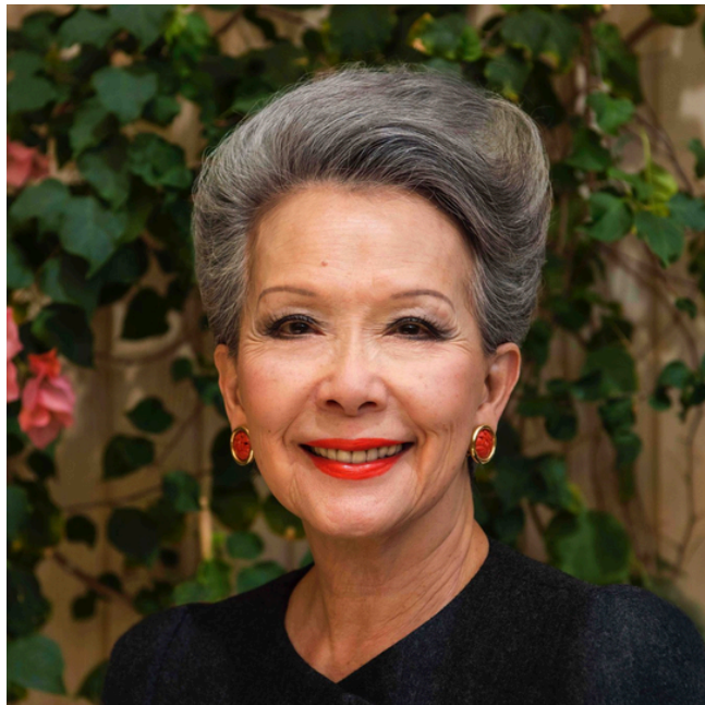
The Honorable Vivienne Poy First Senator of Asian Descent